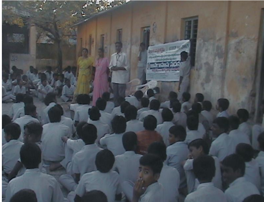
Enforcement visits and school awareness programs by DTCC (Andhra Pradesh).