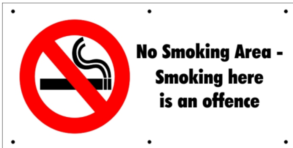
Display of prominent signboard is mandatory at all public places.