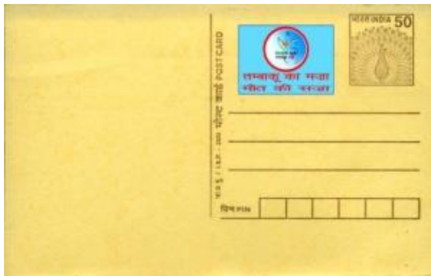
Sample of a postal card bearing an anti-tobacco message