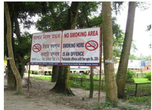
“No Smoking” hoardings at important public places of Jorhat.