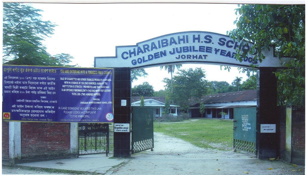
Jorhat Charaibahi Higher Secondary School was declared the first tobacco free School of the North East.