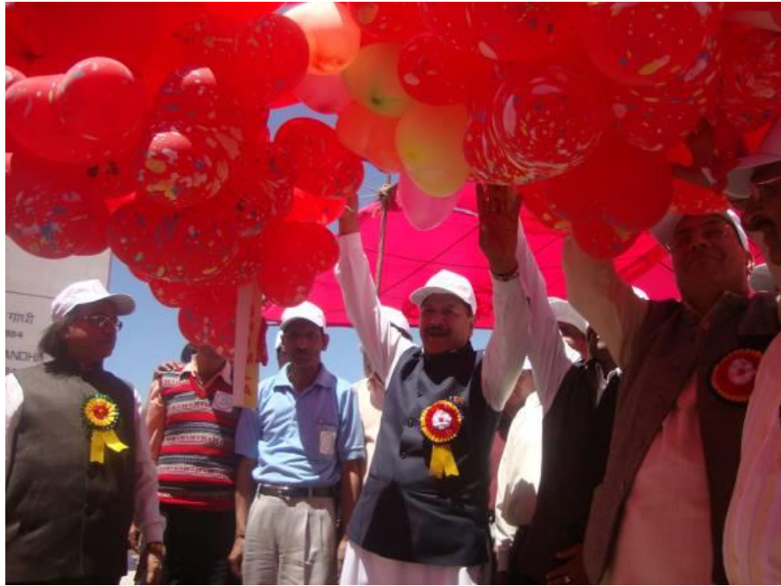
Release of Balloons carrying message of Smoke Free Shimla on 31 st may, 2010.