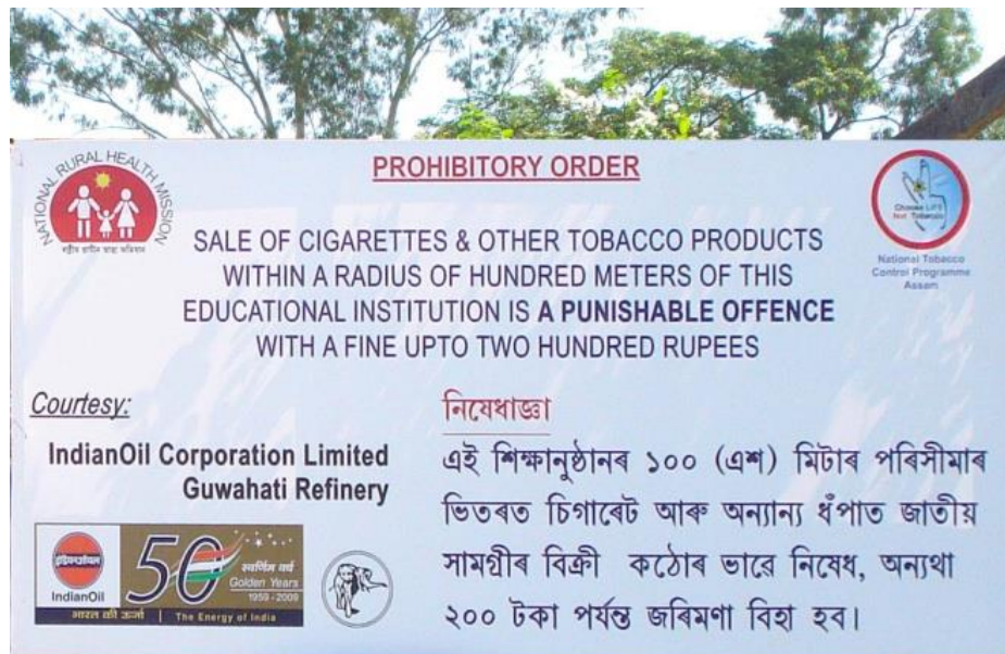
200 sign boards declaring ban on sale of tobacco products near the educational institutes (English and Assamese) were erected across schools and colleges in Guwahati.