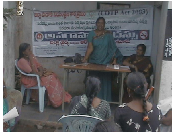
Guntur DTC (District tobacco cell), Andhra Pradesh – staff conducting a Rural community camp at PHC.