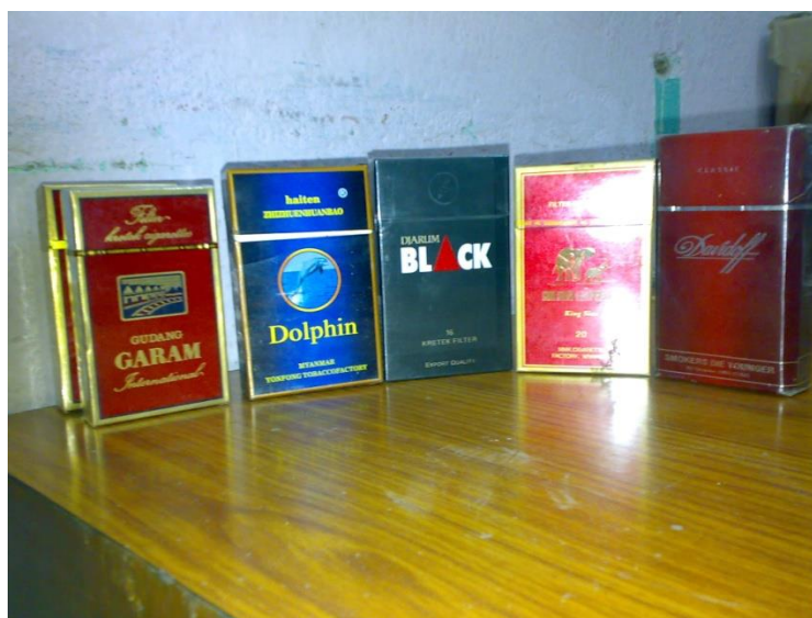
Regular enforcement visits and monitoring of violations – challaned against the violations of section-7, COTPA ( By Andhra Pradesh STCC). Covered in electronic, print and TV media.