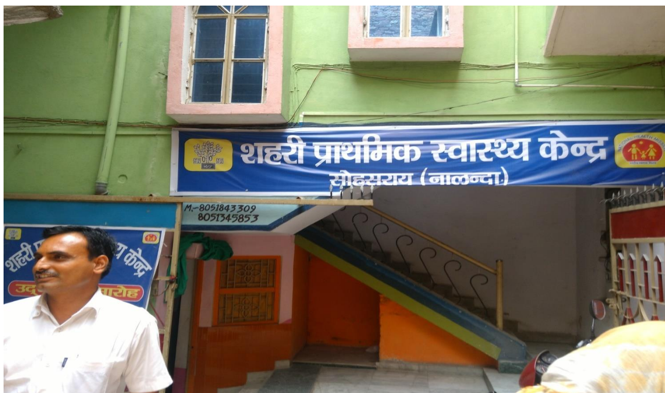
Figure 4 UPHC Sohesarai, Biharsharif (Nalanda)