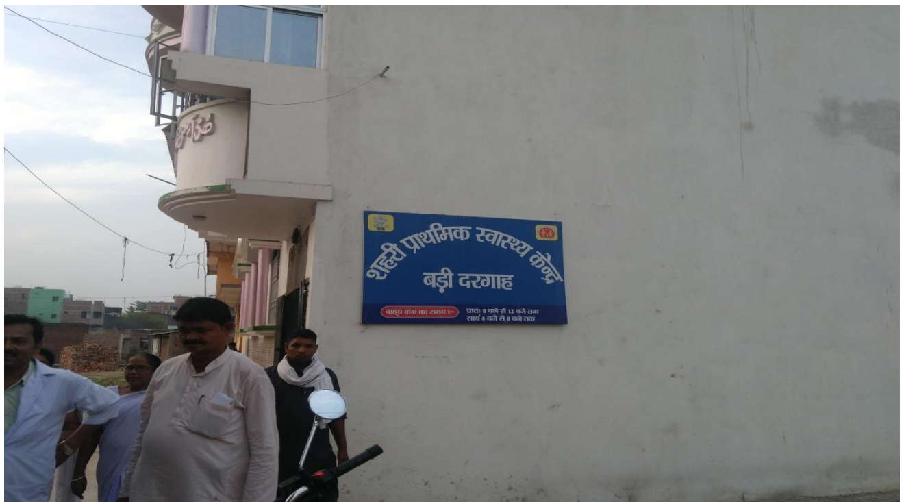
Figure 2 UPHC Badidargah, Bihar Sharif (Nalanda).