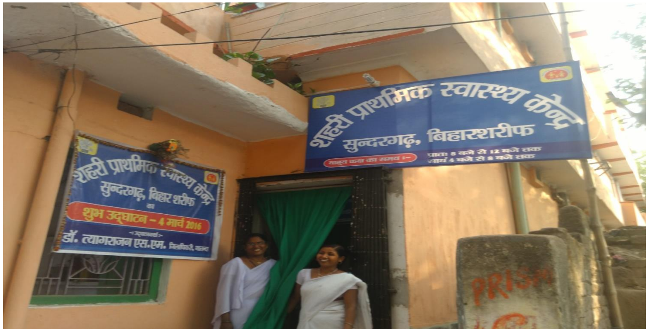
Figure 1 UPHC Sundargardh, Bihar Sharif (Nalanda)