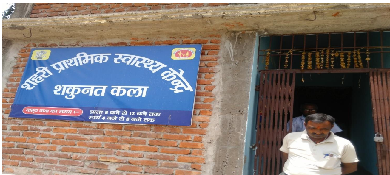
Figure 3 UPHC Sundargardh, Biharsharif (Nalanda).