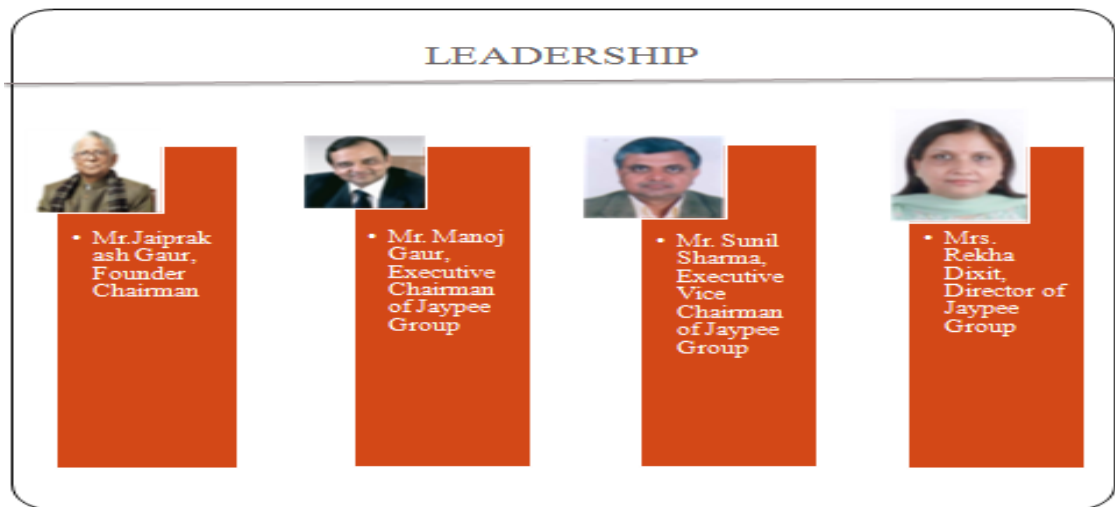
Figure 2 : Leadership Team