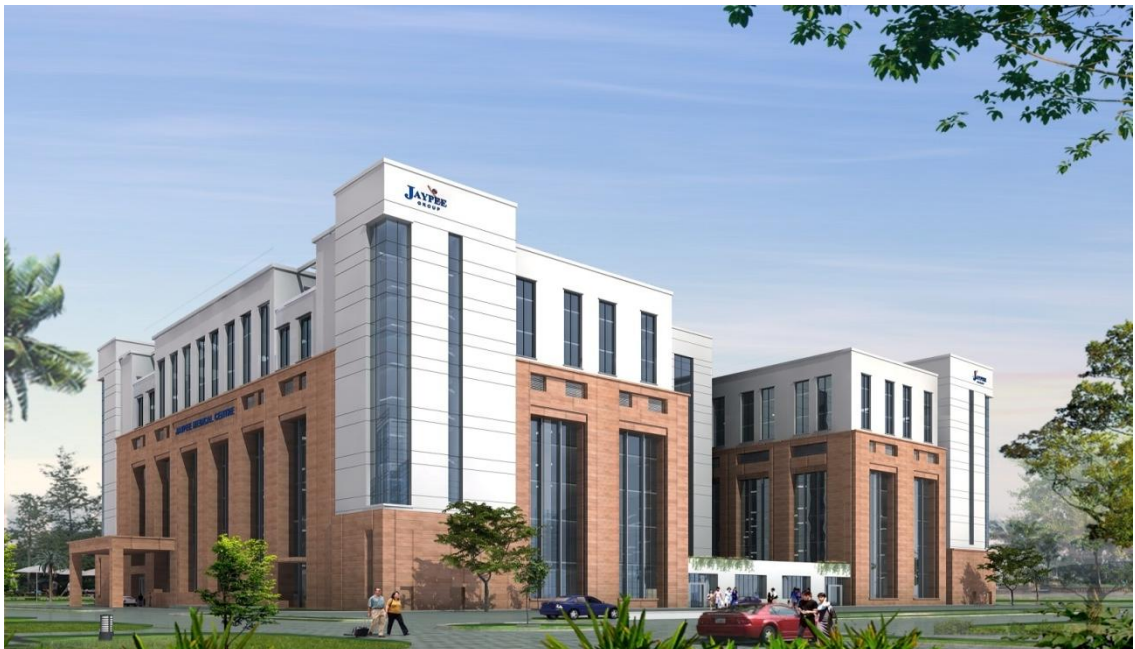
Figure 1 : Prototype of Jaypee Hospital